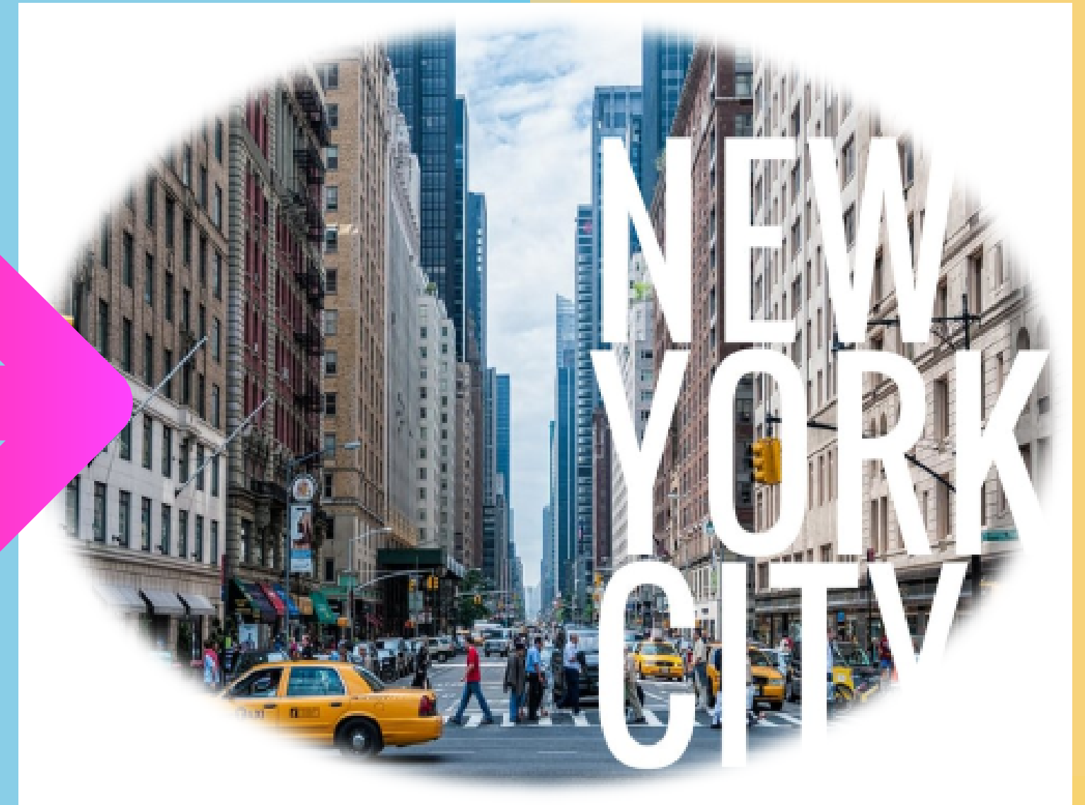
NGO Office to the United Nations