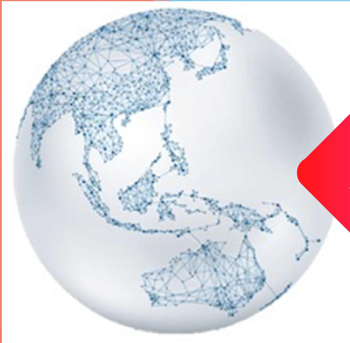
Mary Ward World Network